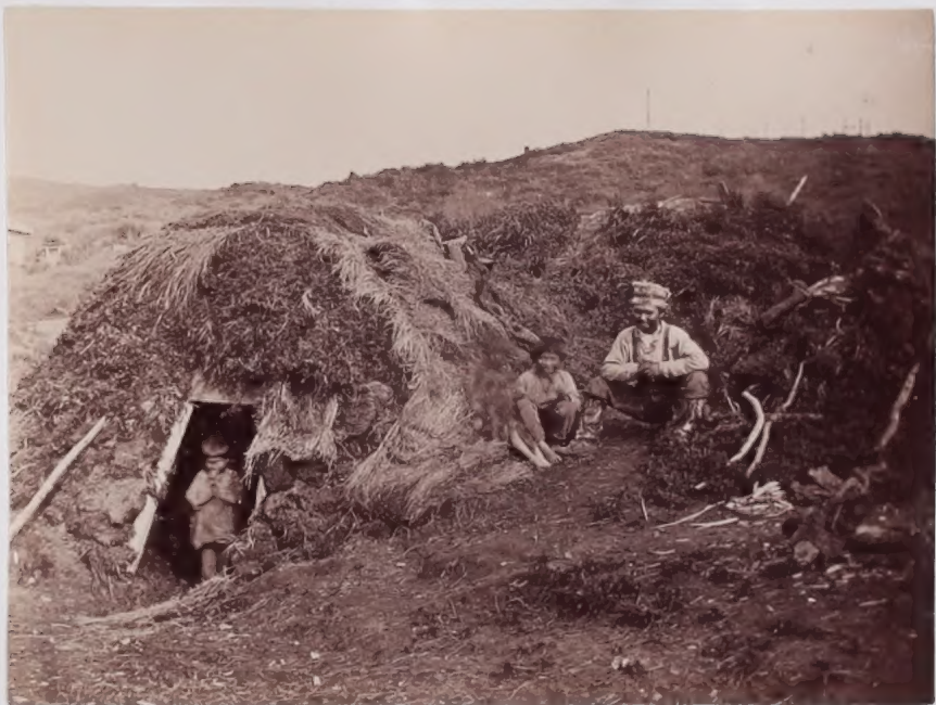
Eskimo Hut. Nushagak